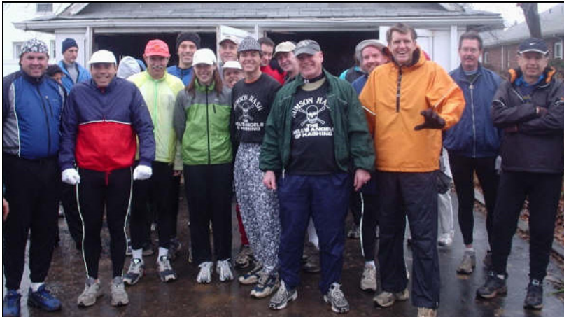
Photo from 2005 Freezing Cold Hash. More photos at http://groups.msn.com/RumsonHash/freezingcoldhash2005.msnw

Directions—see http://www.njlaws.com/directions_to_office.html